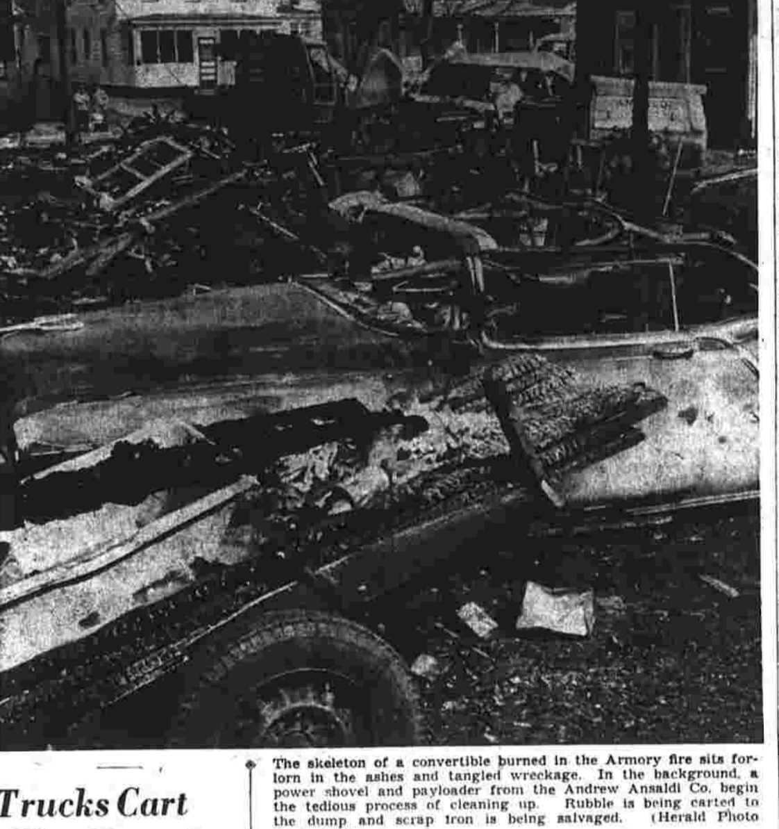
The skeleton of a convertible burned in the Army fire site forlorn in the ashes and tangled wreckage. In the background, a person stands near the wreckage. The debris is being carted to the dump and scrap iron is being salvaged.